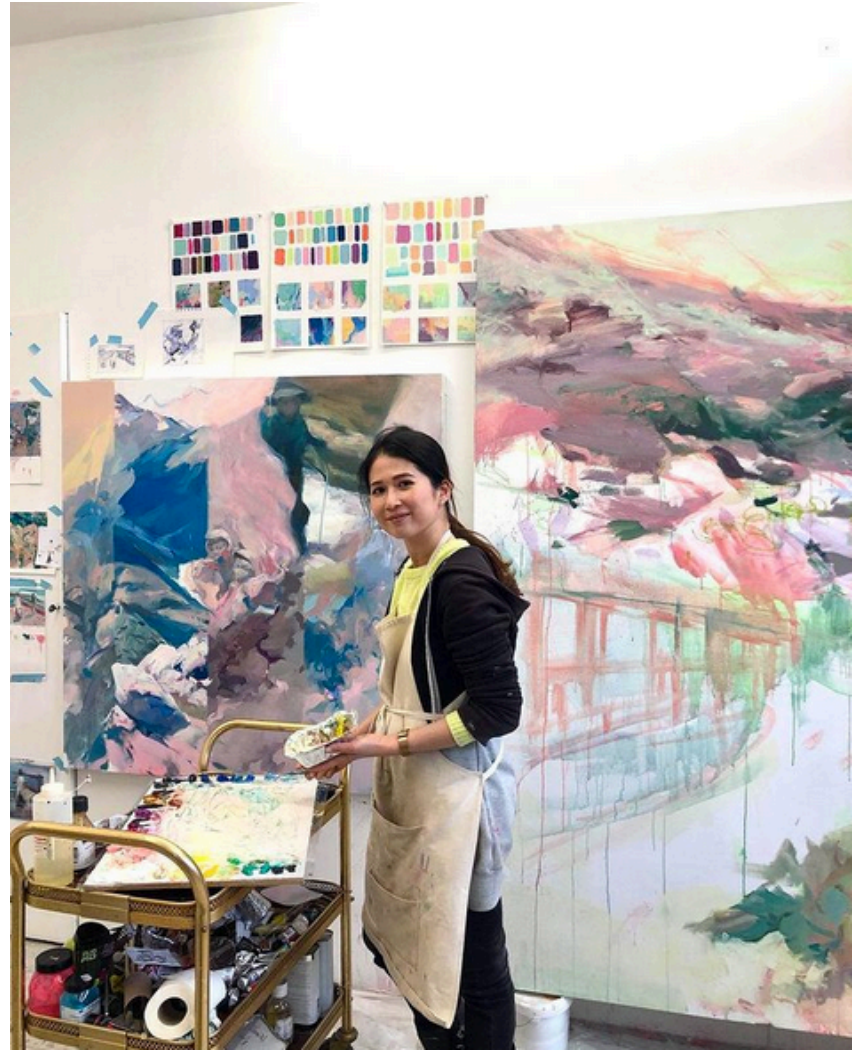
London studio, 2019