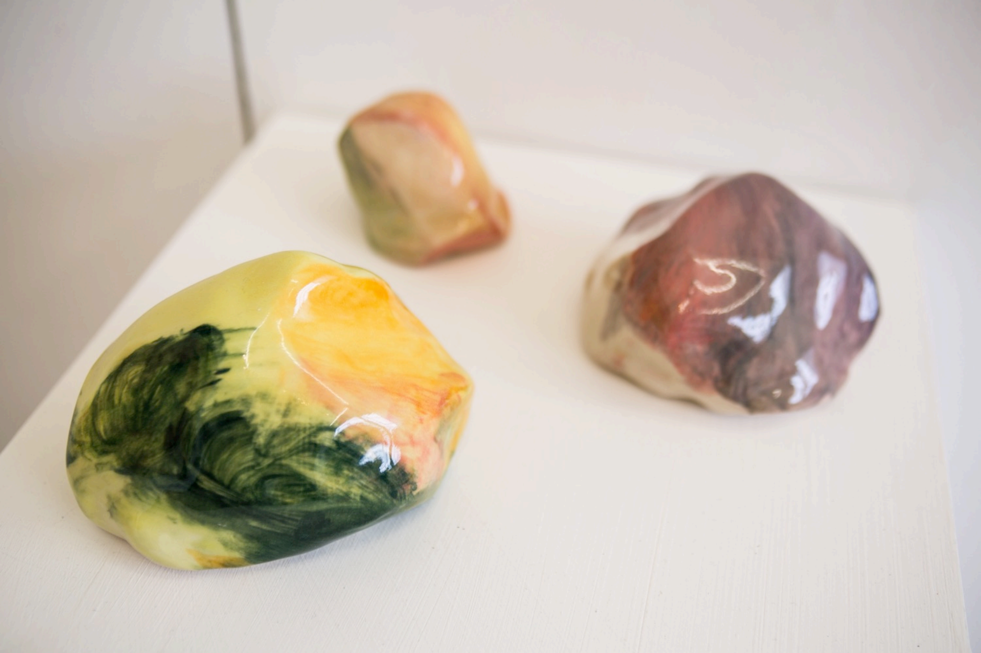
Pebbles Series Earthenware, underglaze Size Varies 2019