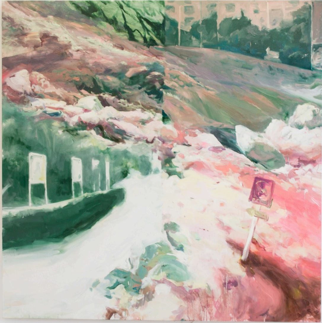
Studio view, London