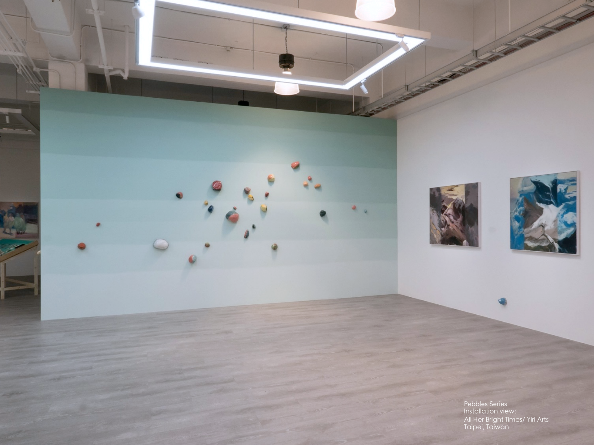
Pebbles Series Installation view: All Her Bright Times/ Yiri Arts Taipei, Taiwan