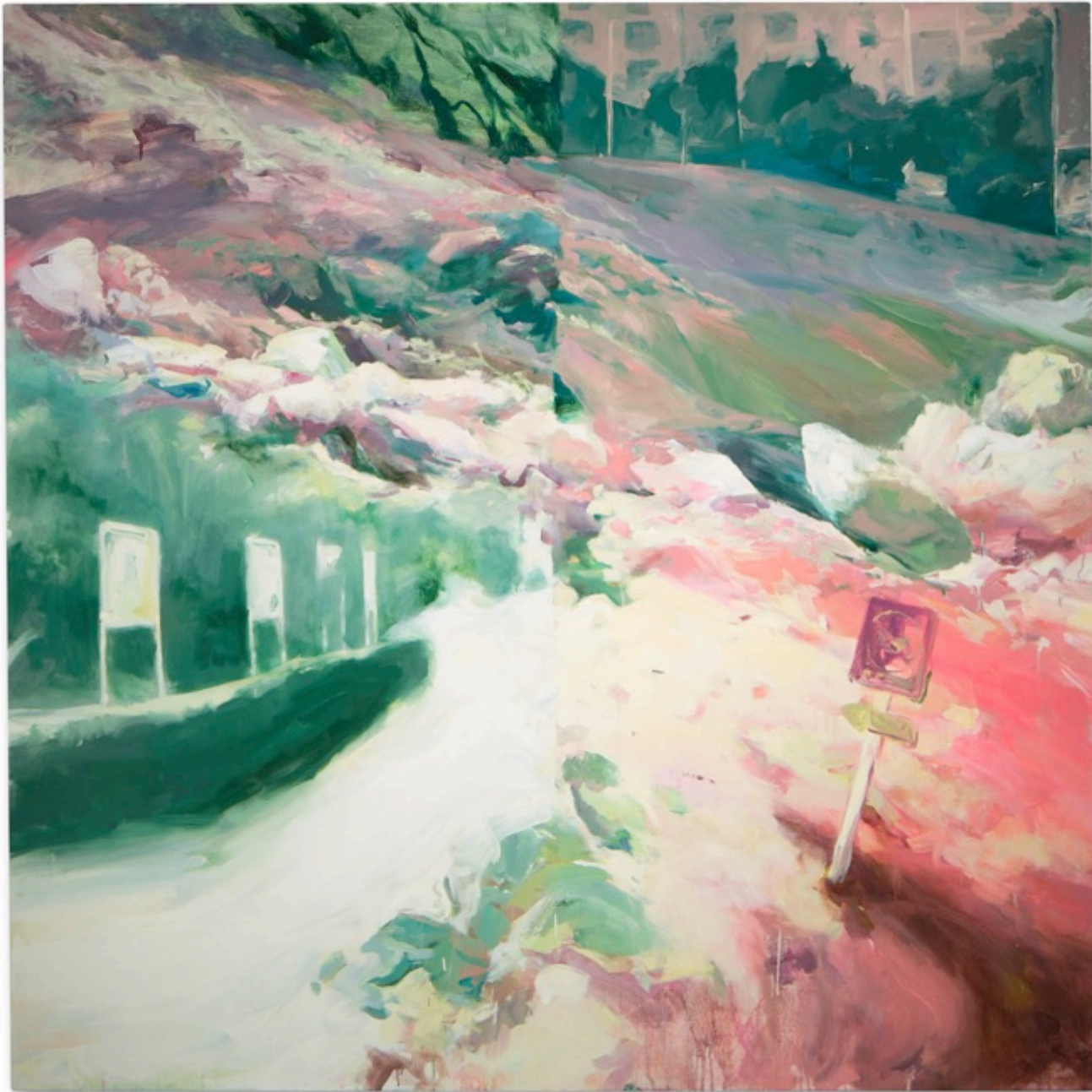
Youth Activities 3 200x200cm 2019 Oil, oil stick and acrylic on canvas