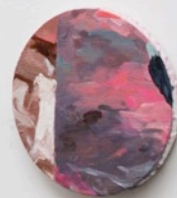
Lakeside fragments 1~5