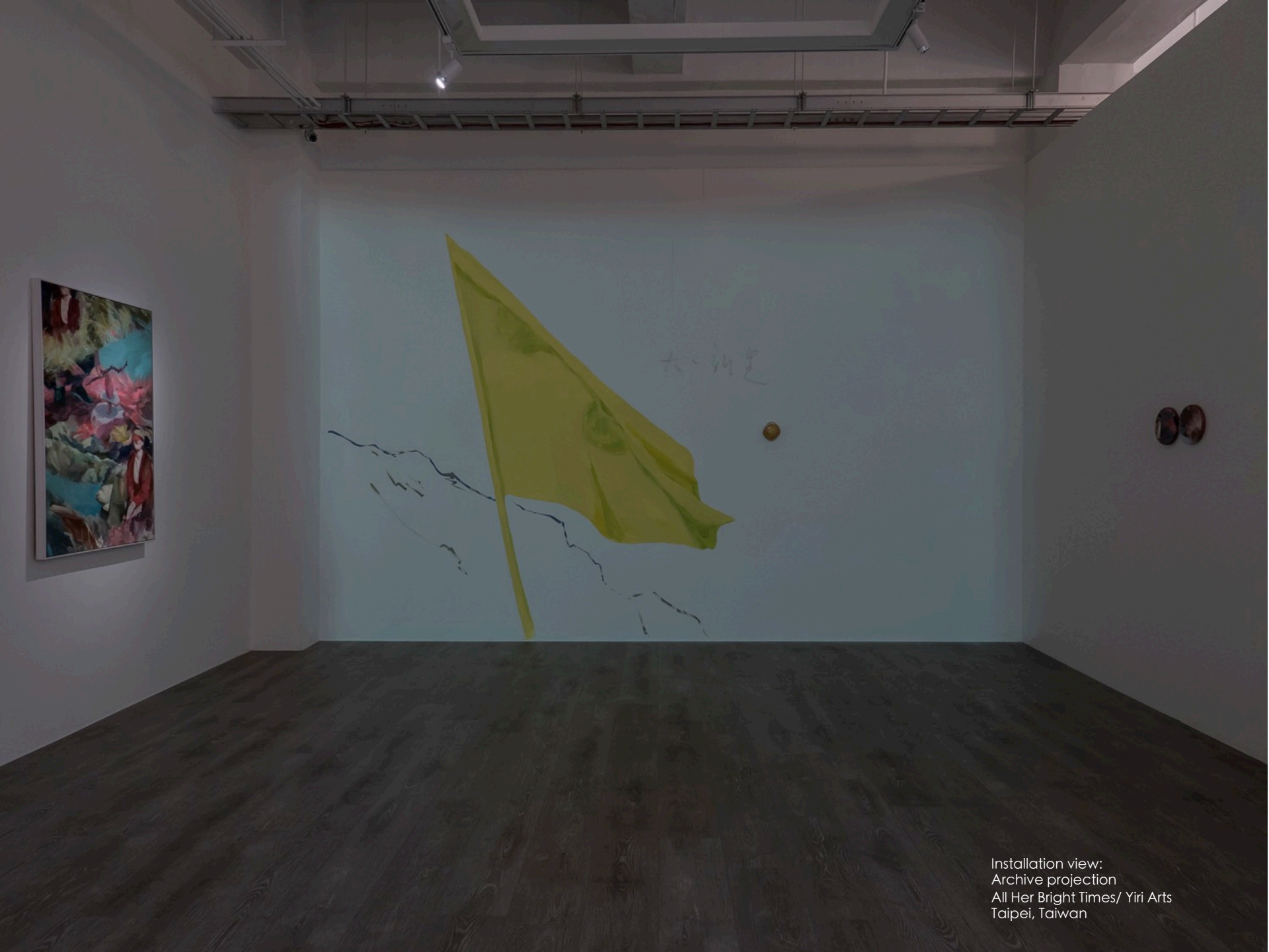
Installation view: Archive projection All Her Bright Times/ Yiri Arts Taipei, Taiwan