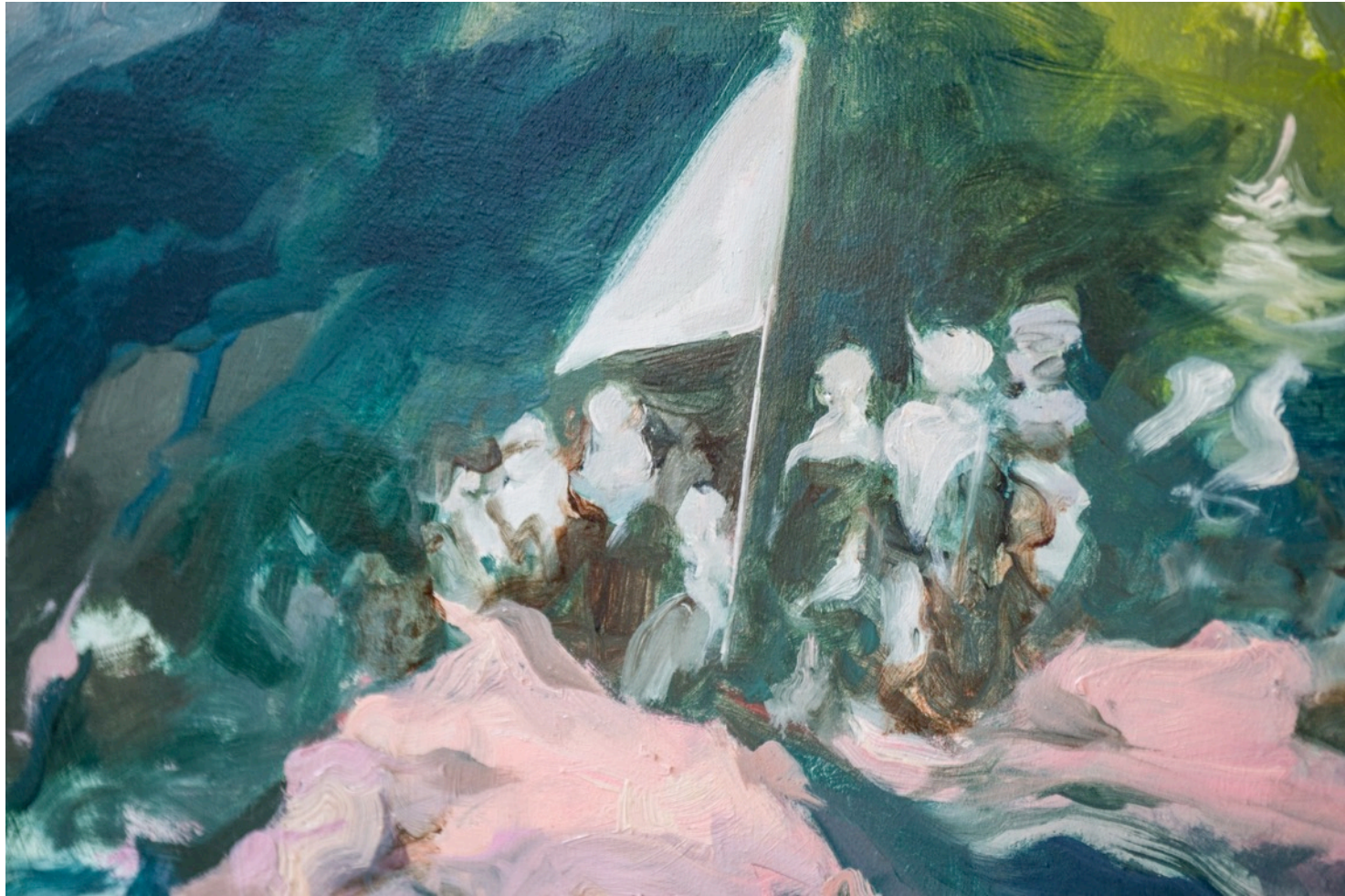
Youth Activities 4 , details