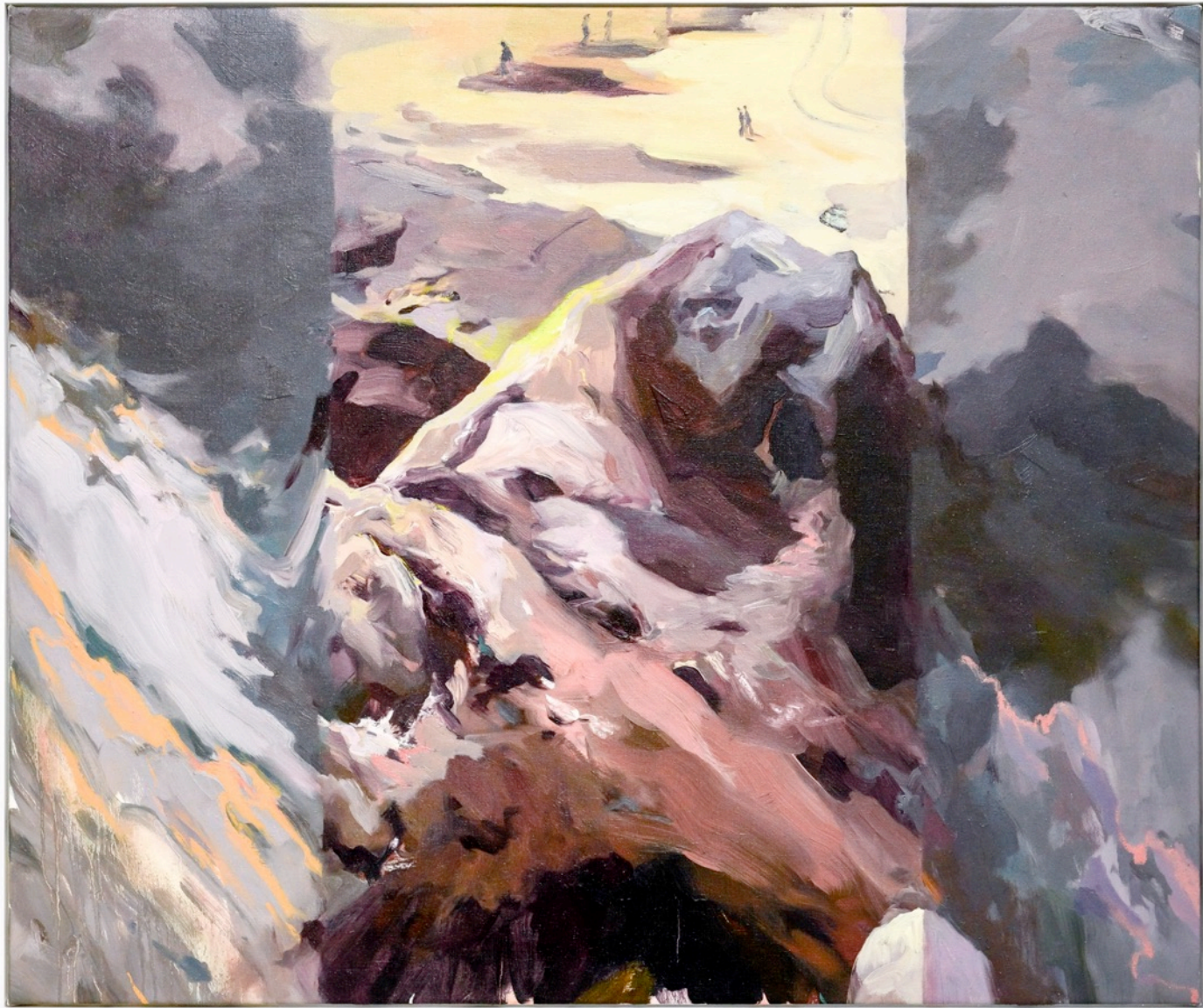
Youth Activities 8 120x100cm 2021 Oil, oil stick and acrylic on canvas