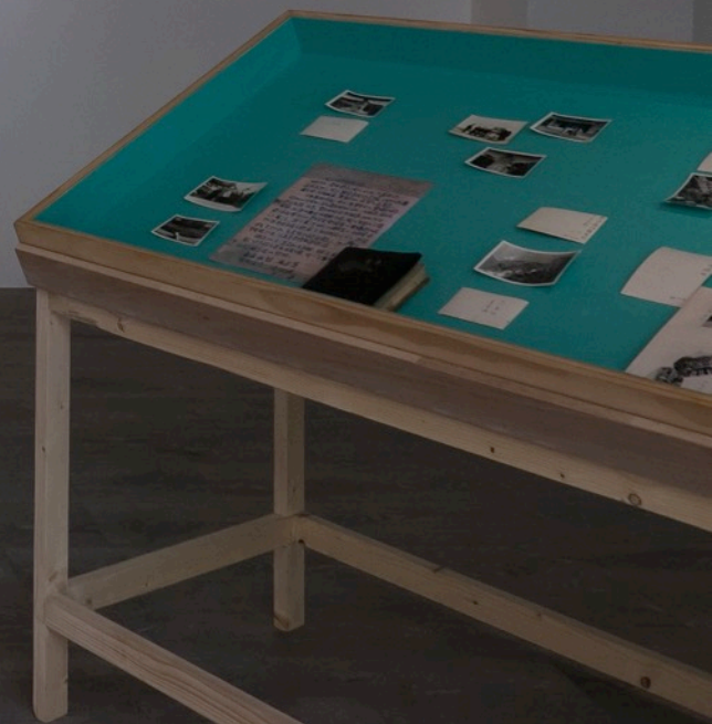
Installation view: All Her Bright Times/ Yiri Arts Taipei, Taiwan