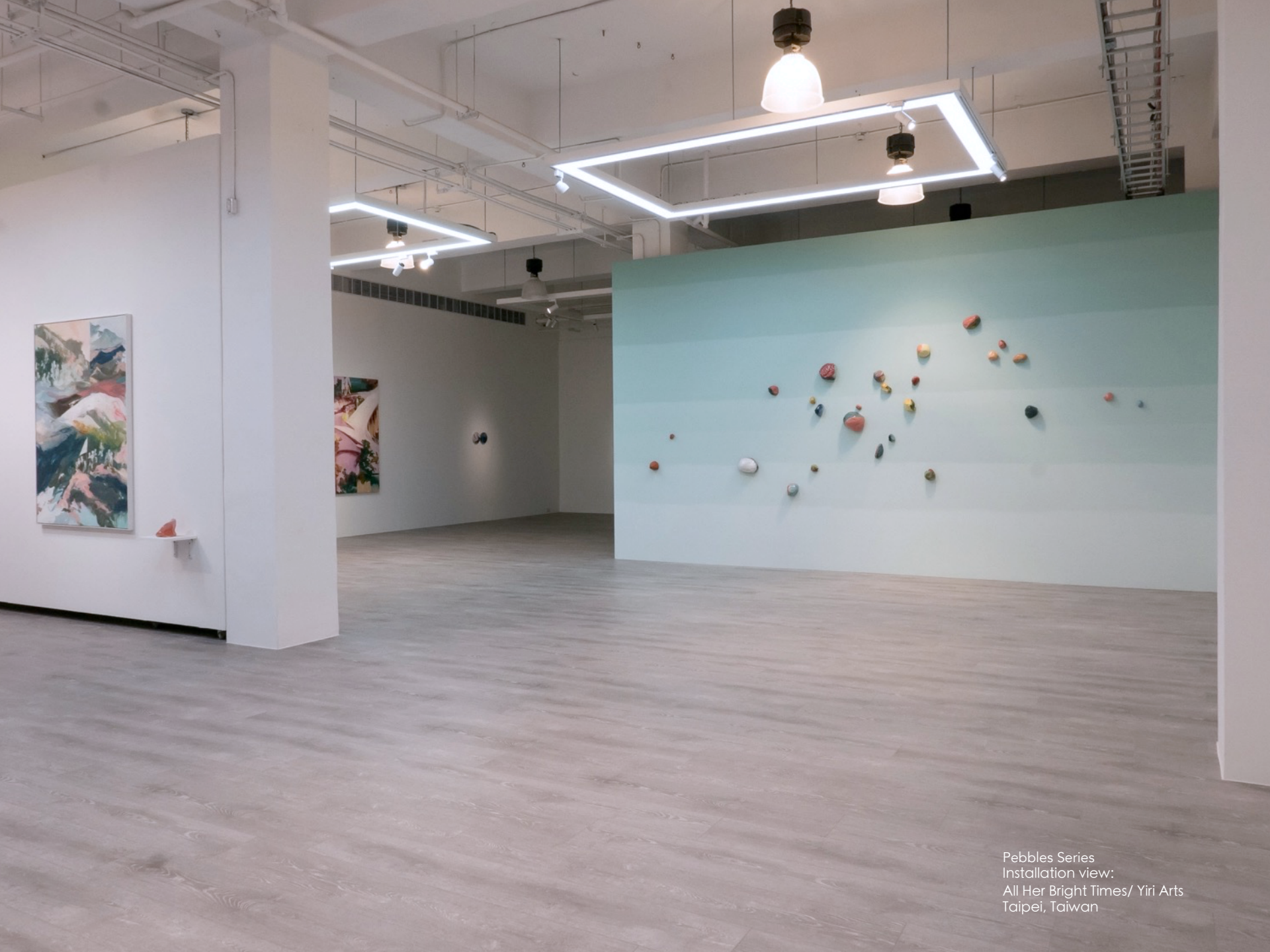
Pebbles Series Installation view: All Her Bright Times/ Yiri Arts Taipei, Taiwan