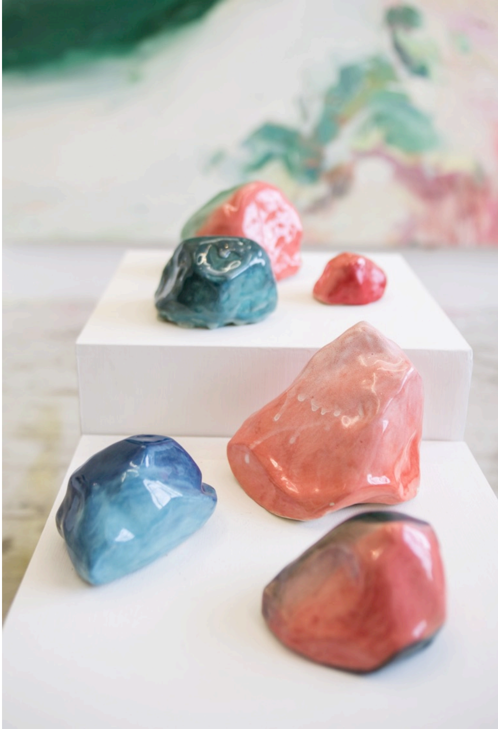
Pebbles Series Earthenware, underglaze Size Varies 2019