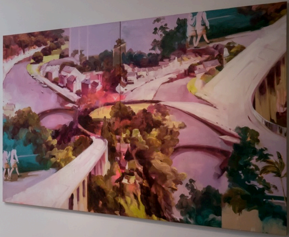
Installation view: All Her Bright Times / Yiri Arts Taipei, Taiwan