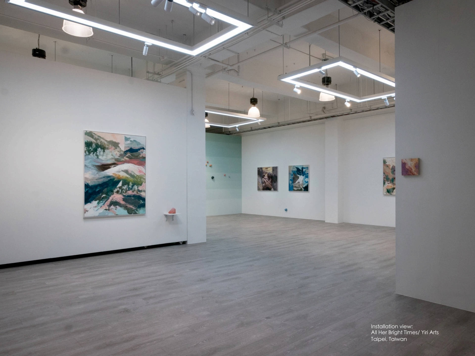
Installation view: All Her Bright Times/ Yiri Arts Taipei, Taiwan