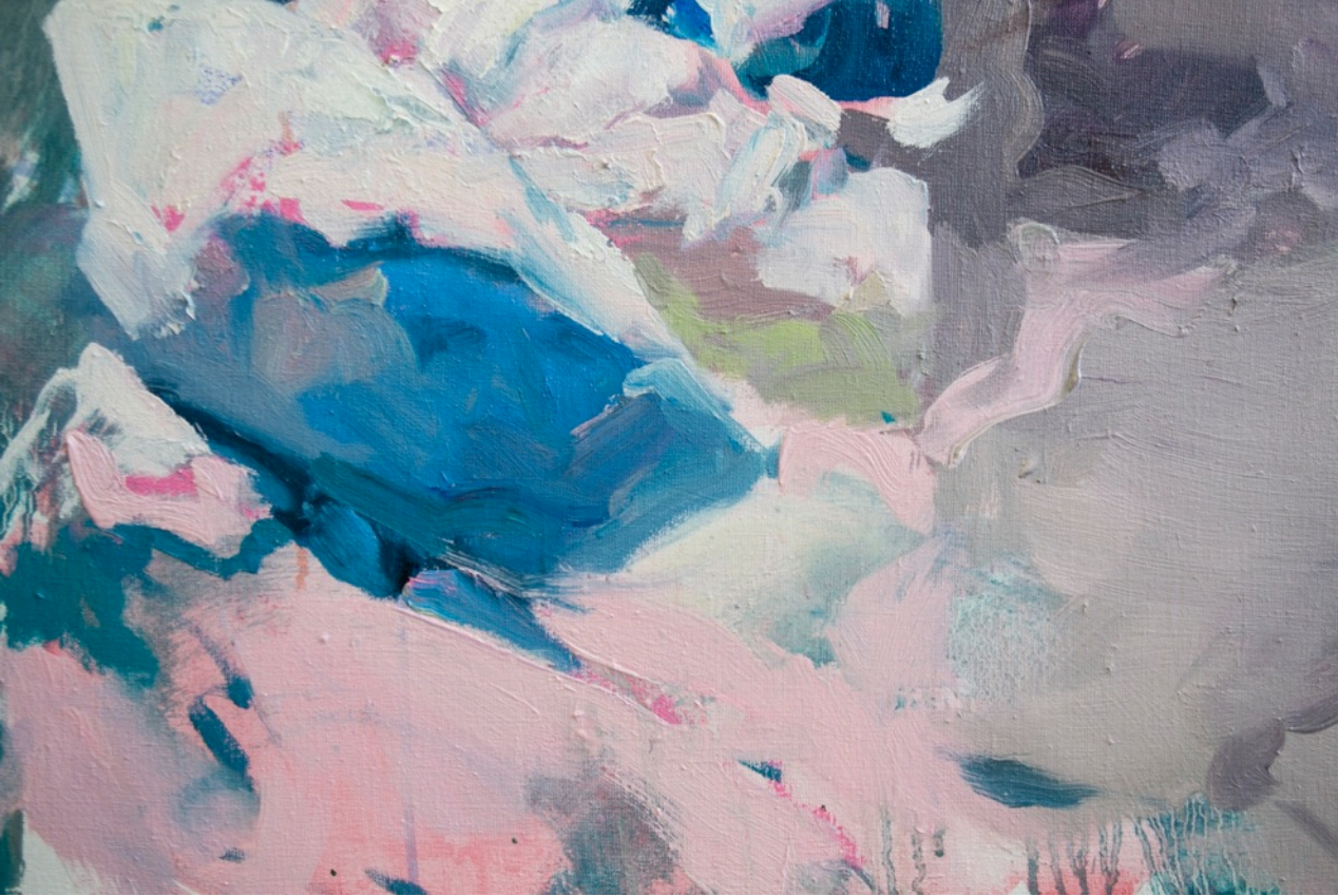
Youth Activities 2, details