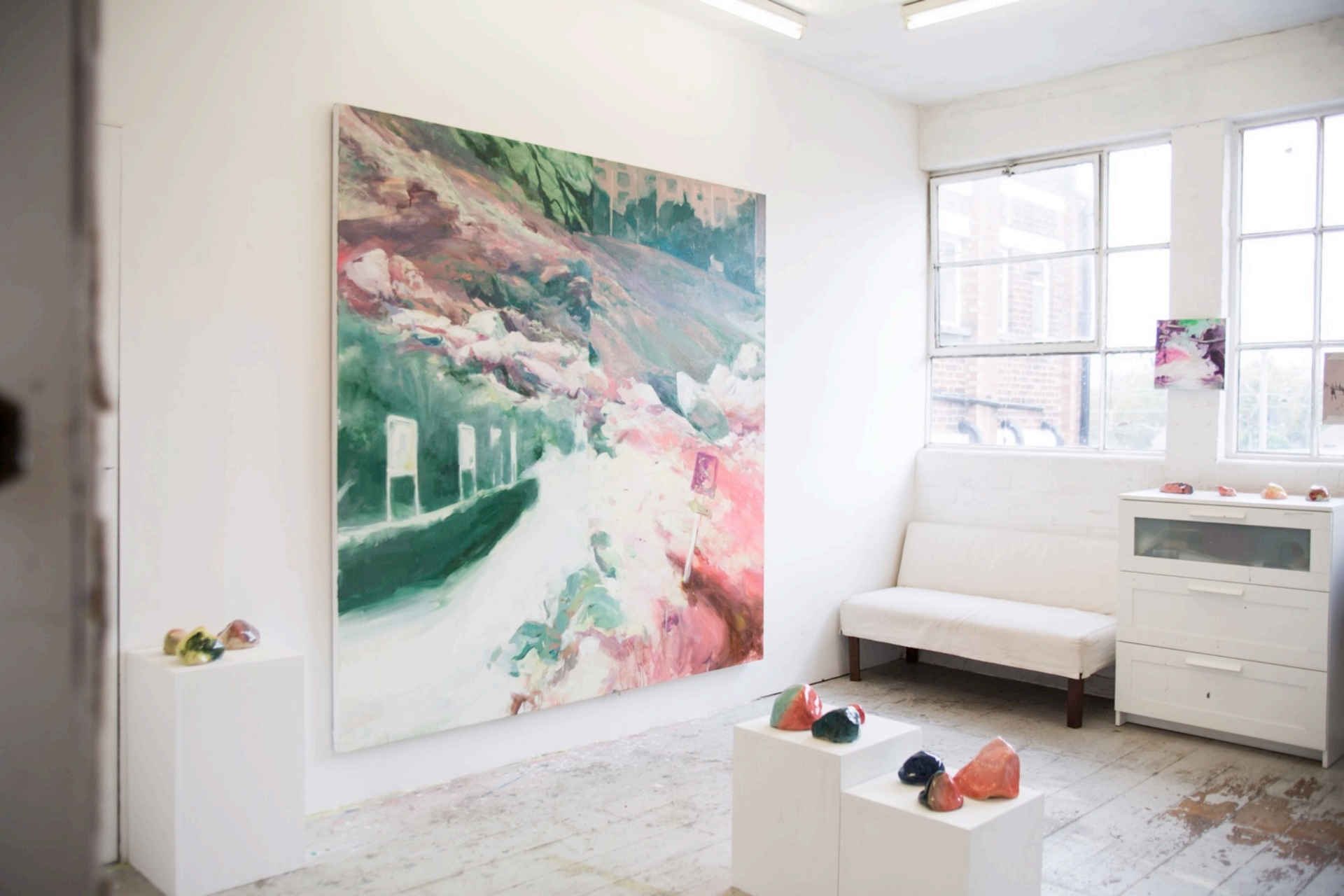
Studio view, London