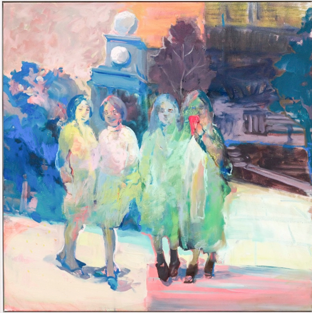
Youth Activities 9 100x100cm 2021 Oil, oil stick and acrylic on canvas