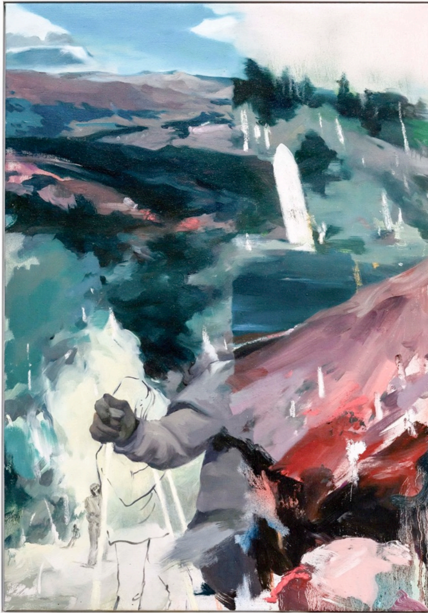
Winter Games 1 100x70cm 2021 Oil, oil stick and acrylic on canvas