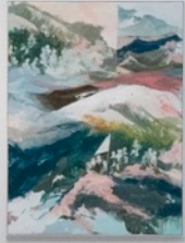
Installation view: All Her Bright Times/ Yiri Arts Taipei, Taiwan

THE 1980s BY YI RI The 1980s was a decade of significant change in Taiwan. It was a time of rapid economic growth and modernization, but also a period of political transition and social movement. The decade saw the end of martial law and the beginning of democratic reforms. The arts reflected these changes, with a focus on social realism and a renewed interest in traditional Chinese aesthetics. This exhibition explores the diverse artistic expressions of the 1980s, from the bold, expressive works of the 'New Wave' to the more subtle, reflective pieces of the 'New Realism'.