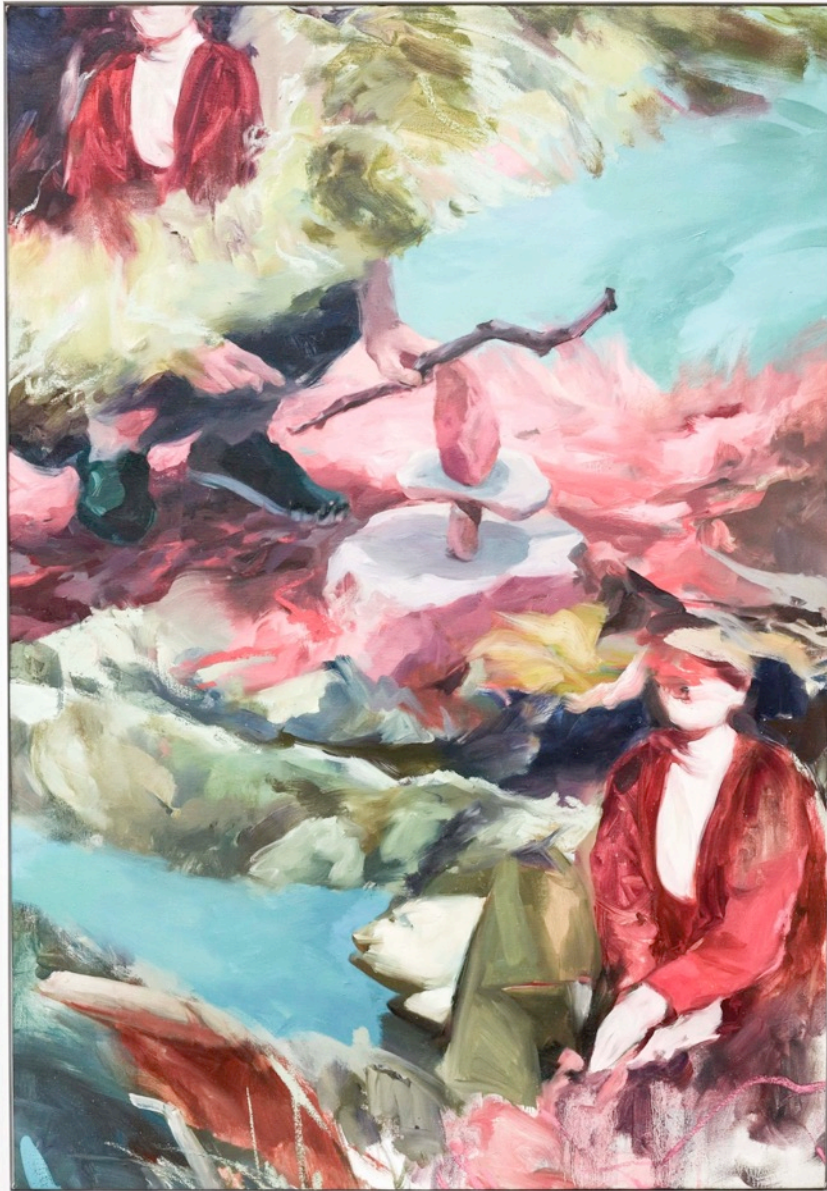
Youth Activities 6 130x70cm 2021 Oil, oil stick and acrylic on canvas