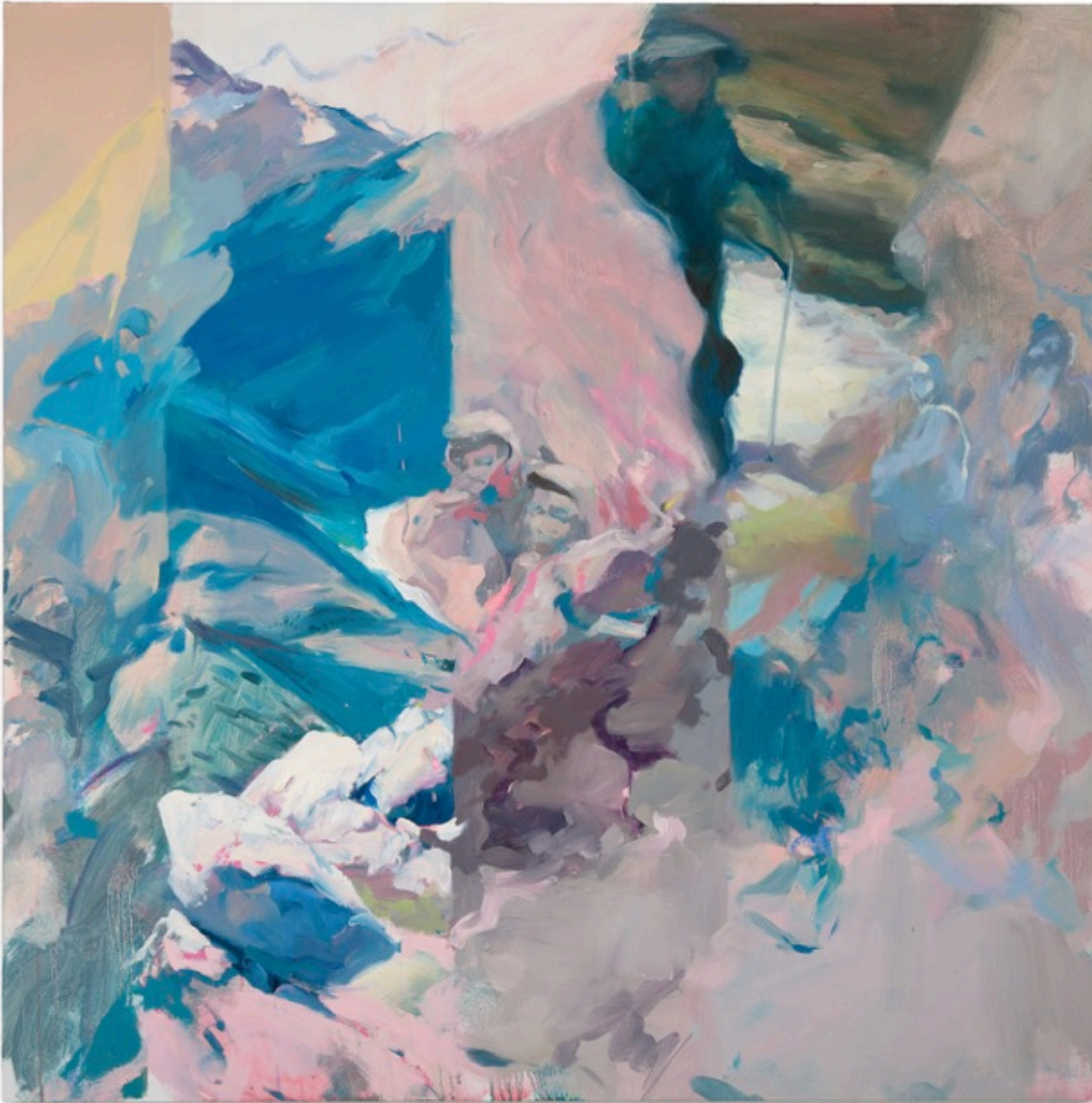
Youth Activities 2 120x120cm 2019 Oil, oil stick and acrylic on canvas