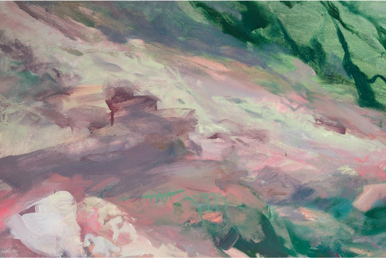
Youth Activities 3, details