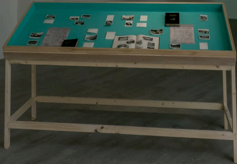
Installation view: Source archive display All Her Bright Times/ Yiri Arts Taipei, Taiwan