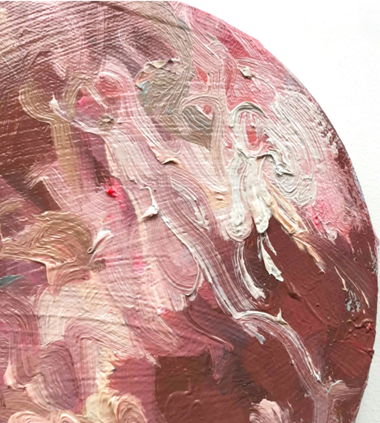
Lakeside Fragments 2, details