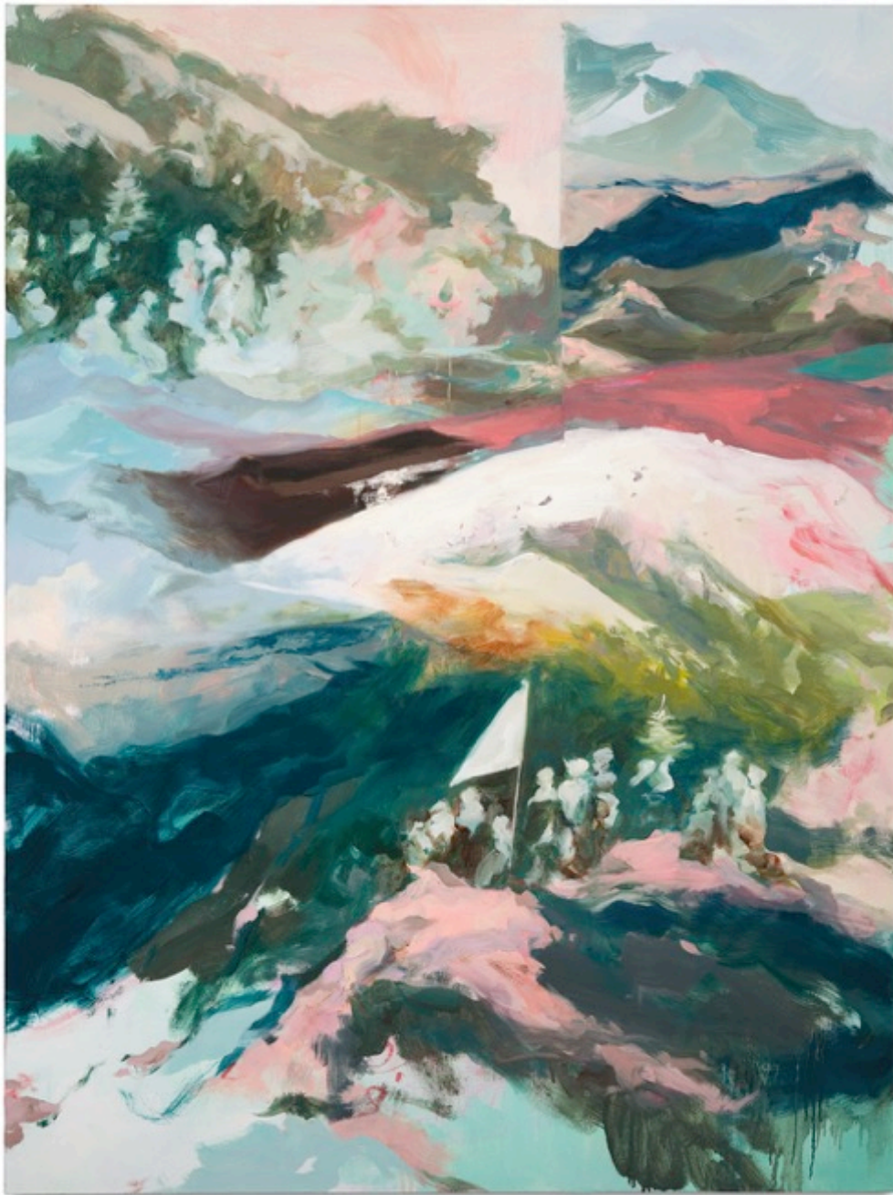
Youth Activities 4 160x120cm 2019 Oil, oil stick and acrylic on canvas