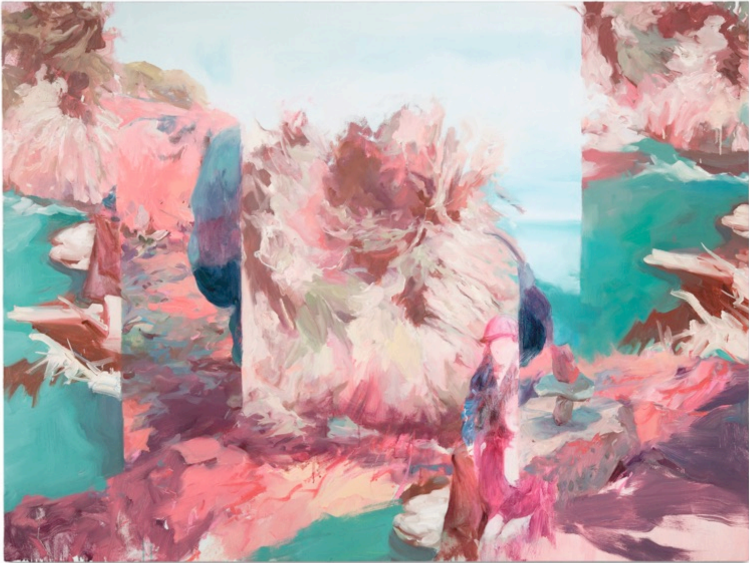
Youth Activities 5 160x120cm 2019 Oil, oil stick and acrylic on canvas