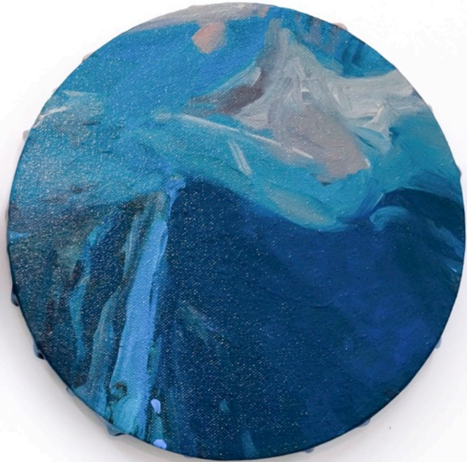
Mountain View 1, 2 20cm diameter 2021 Oil, oil stick and acrylic on canvas