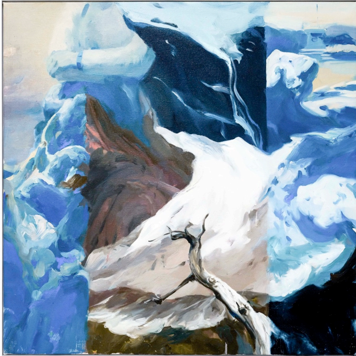
Youth Activities 7 100x100cm 2021 Oil, oil stick and acrylic on canvas