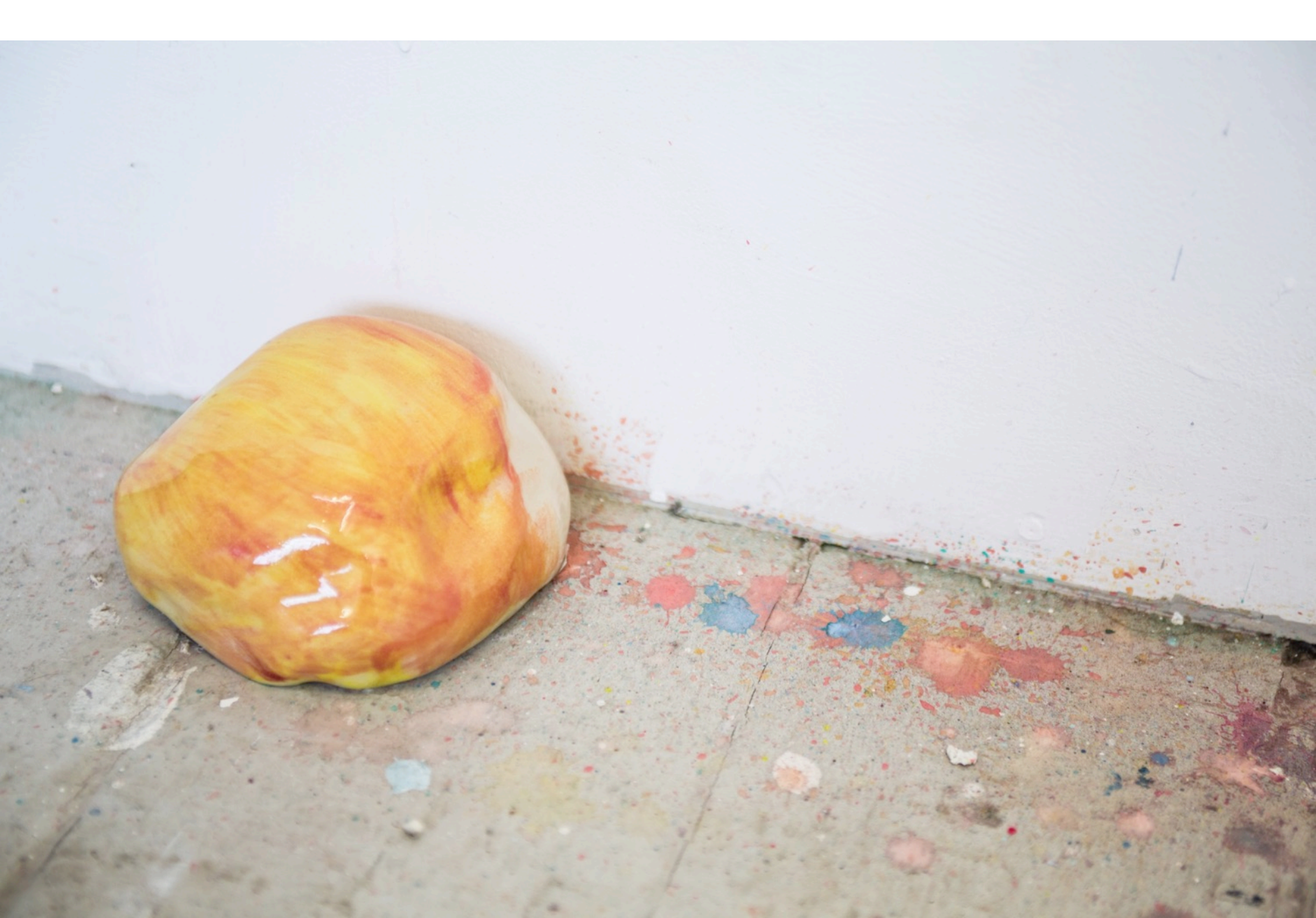
Pebbles M1, Earthenware, underglaze 2019 14.5cm(L) 10cm(W)9.5cm (H) Studio view, London