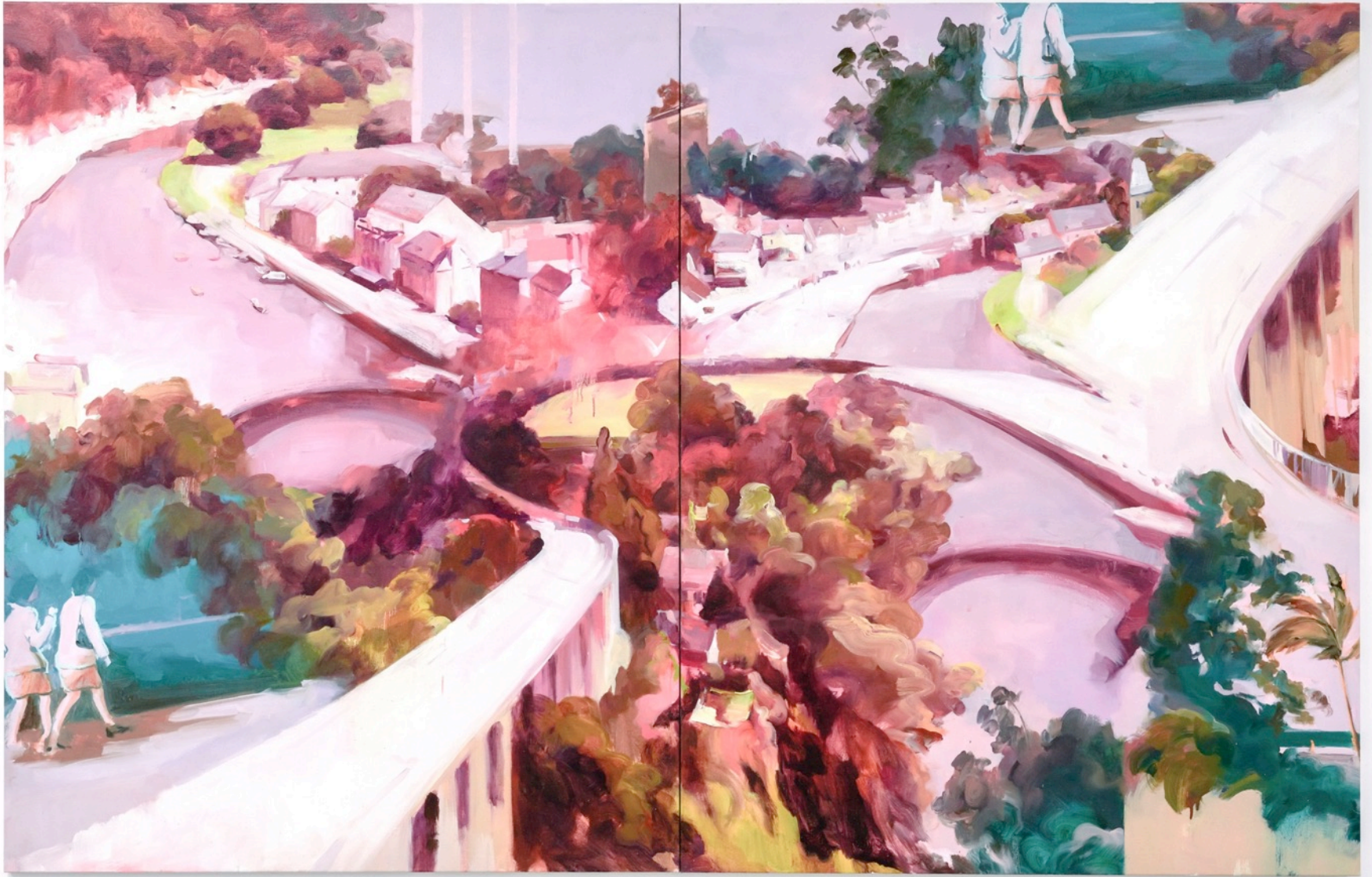
A Walk Together 280x180cm (Diptych) 2021 Oil, oil stick and acrylic on canvas